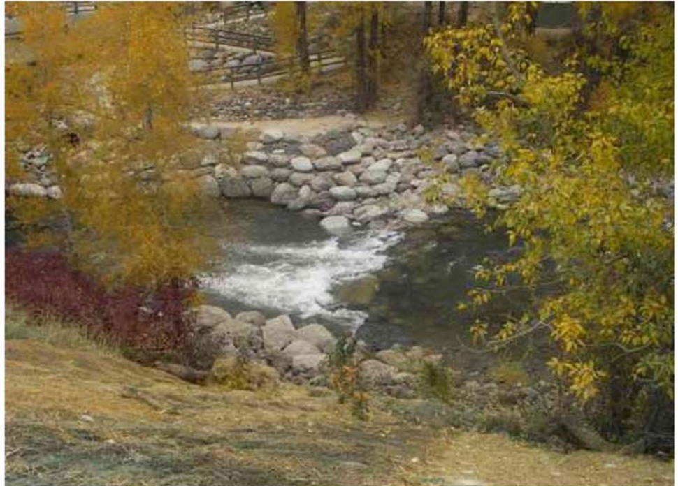
Eagle River at Avon Recreation Enhancements

Our whitewater park will attract visitors to restaurants and shops throughout town, who will rent equipment, stay in lodging, enjoy other area attractions and fill up with gas. Increased sales tax revenue will benefit the town's infrastructure, real estate will rise in value, and jobs will be created by the influx of tourist dollars. A recent report by the Outdoor Industry Foundation shows that outdoor recreation produces $7.6 billion annually in retail sales and services across Colorado accounting for 4% of the gross state product.